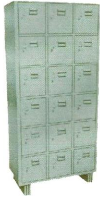
Industrial Locker W-36" x H-78" x D-19"