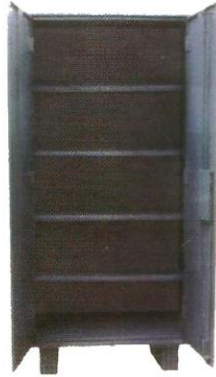
Steel Almirah W-36" x H-78" x D-19"