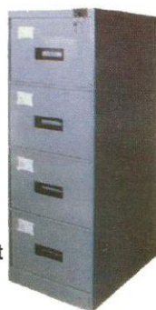
4 Drawer Filing Cabinet W-27" x H-54" x D-18"