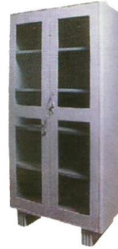
Steel Glass Door Almirah W-36" x H-78" x D-19"